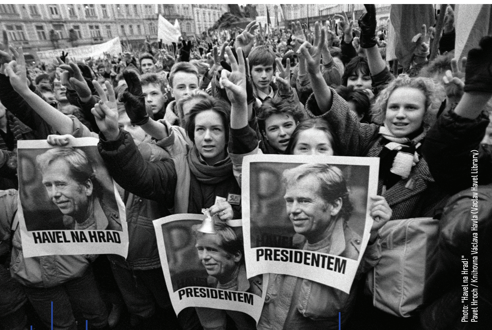
"Havel na Hrad!"

How to sustain the path towards Europe Whole and Free?